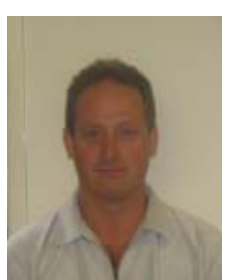
Grant Gains ICT