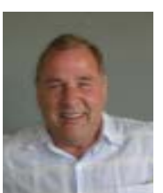
Lloyd Poole Music