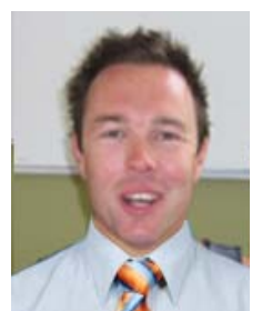
Jabyng Hogarth Physical Education